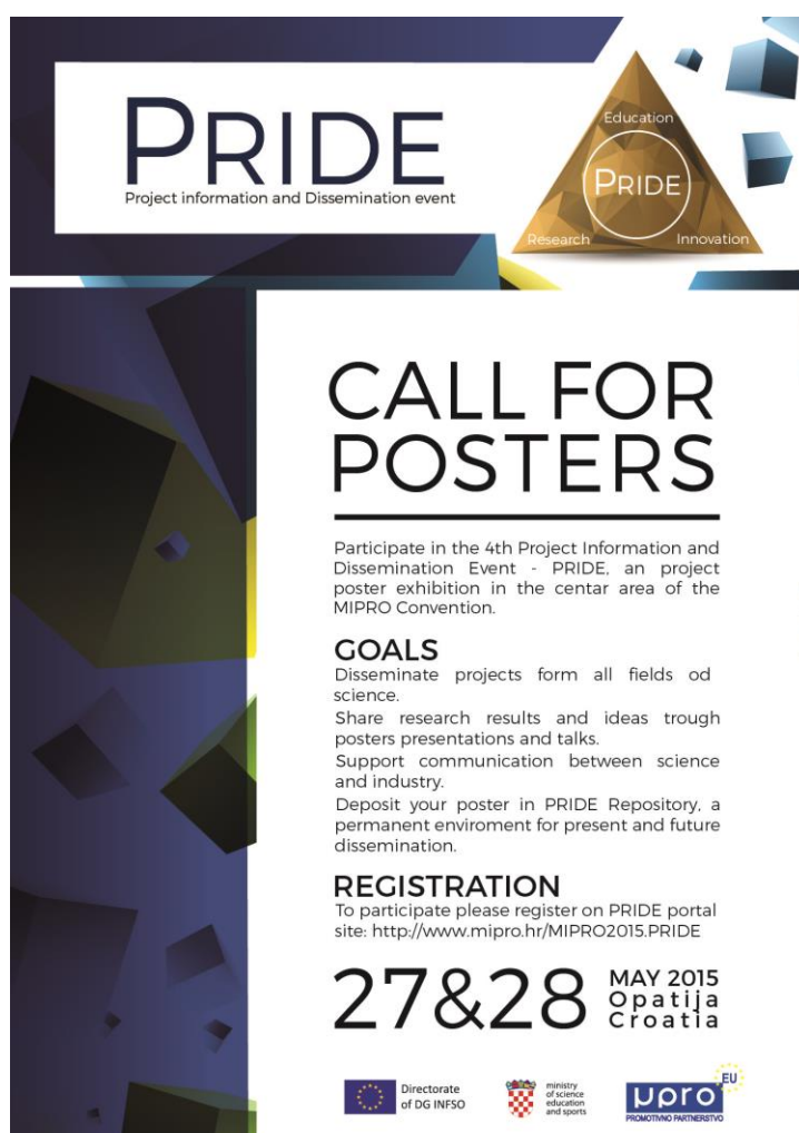
Call for posters